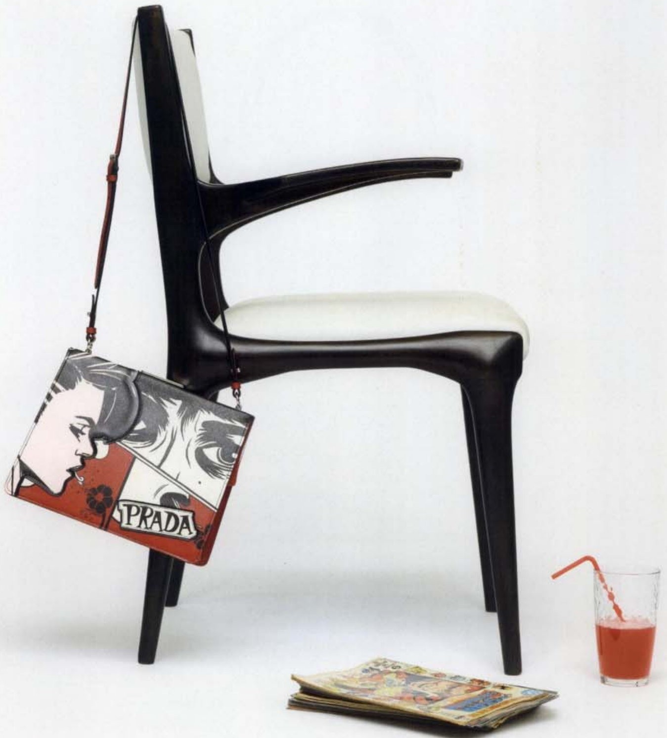
Bolso en piel Prada Light Frame, de Prada (1.850 €).