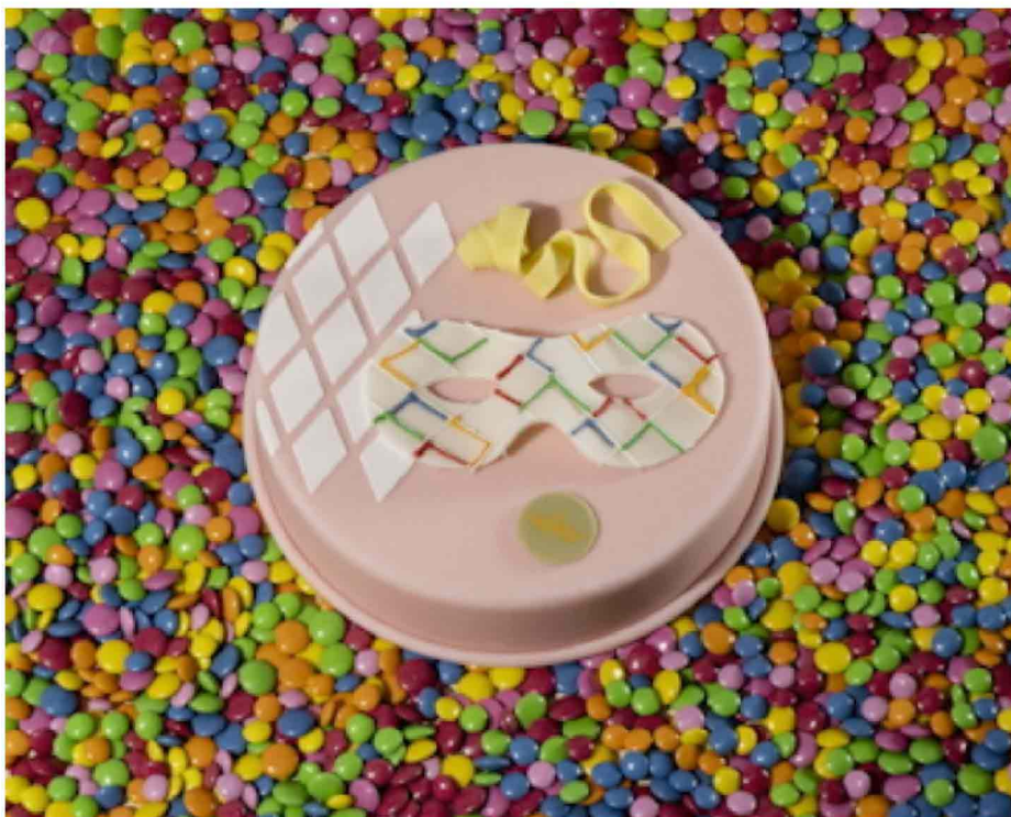
Maschera: questo è il tema delle torte di Marchesi 1824 per Carnevale.