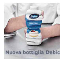
Nuova bottiglia Debic

Ritaglio stampa ad uso esclusivo del destinatario, non riproducibile.