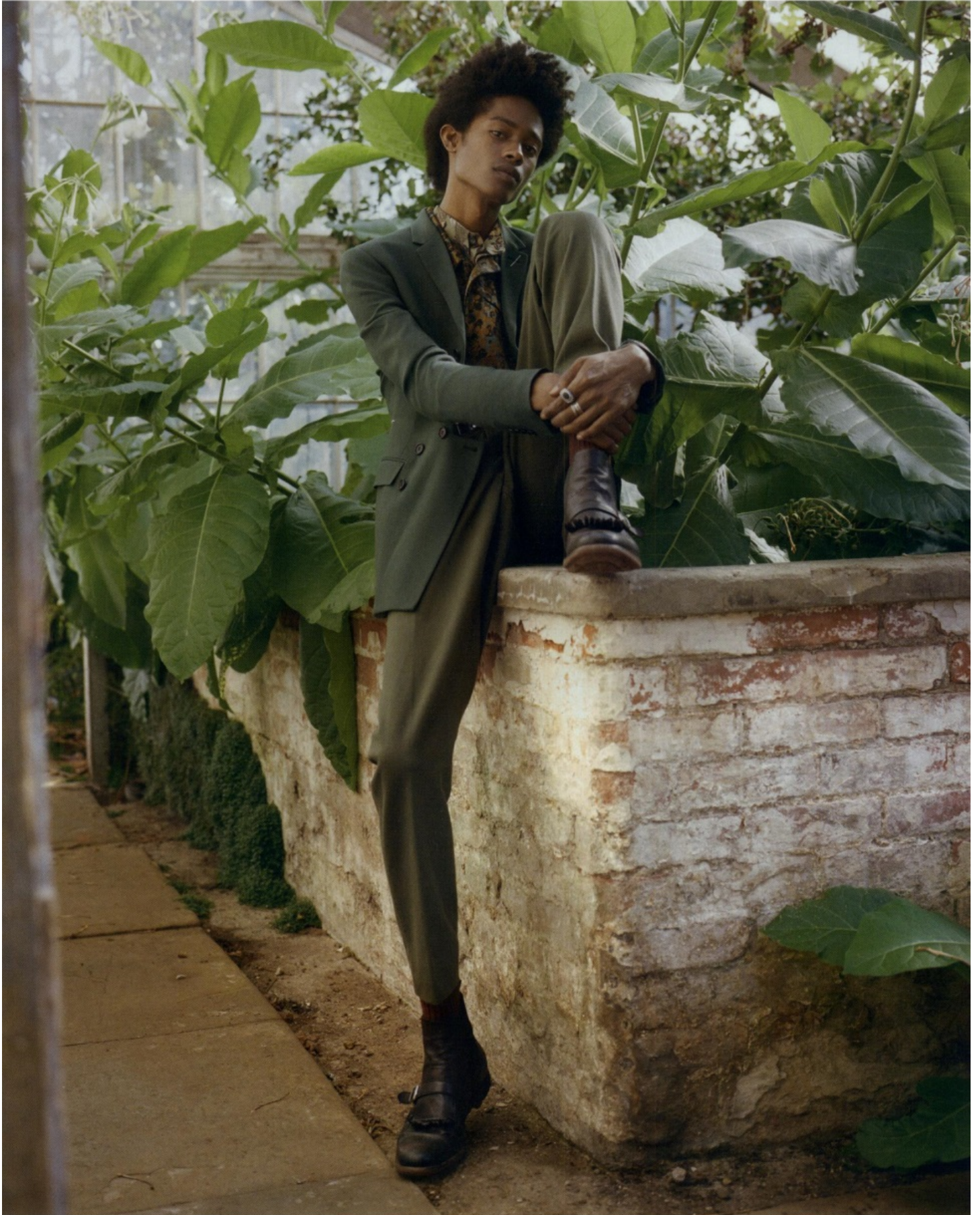
ITALIA - ICON - CHURCH'S - 01.09.18