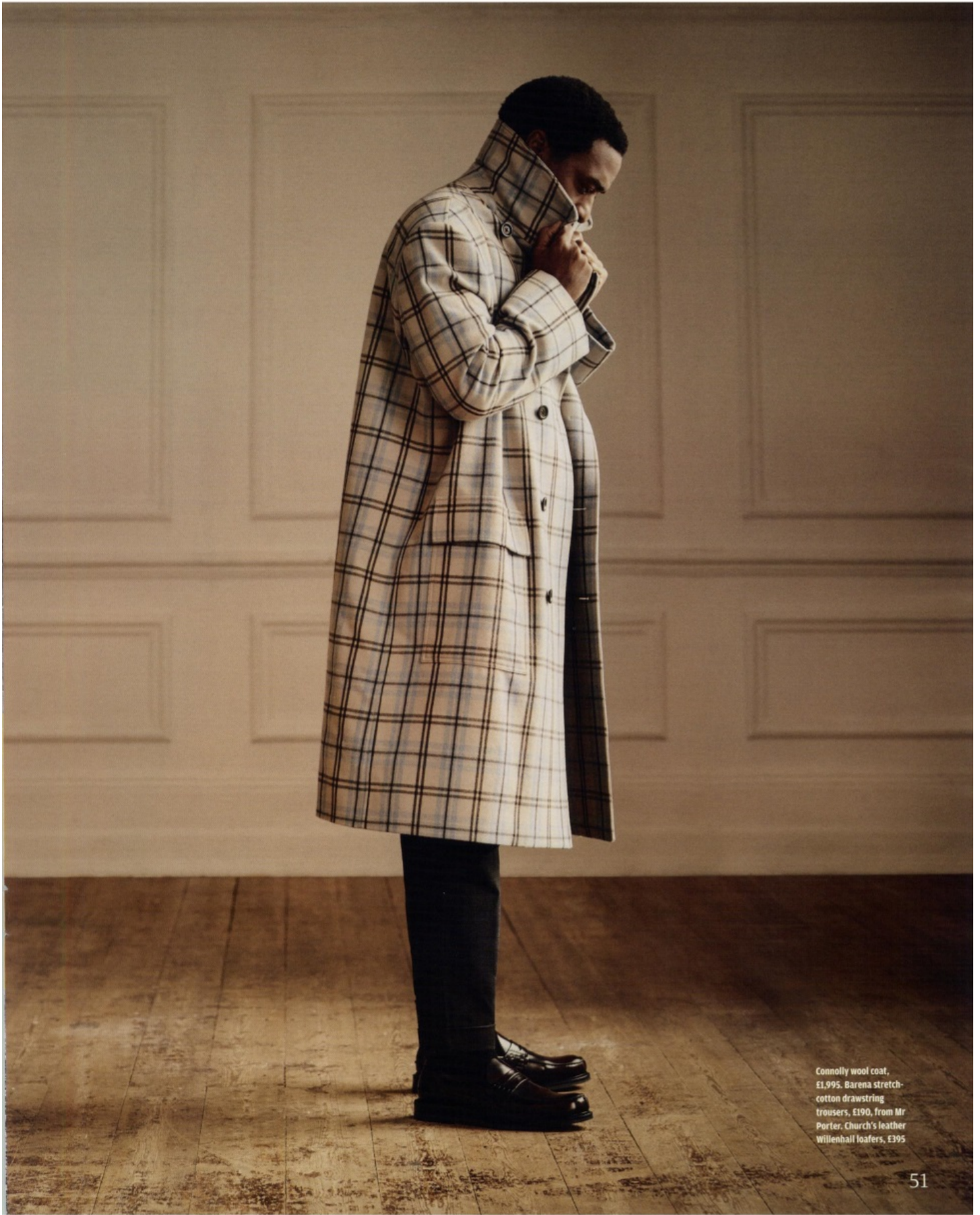
Connolly wool coat, £1,995. Barena stretch-cotton drawstring trousers, £190, from Mr Porter. Church's leather Willenhall loafers, £395