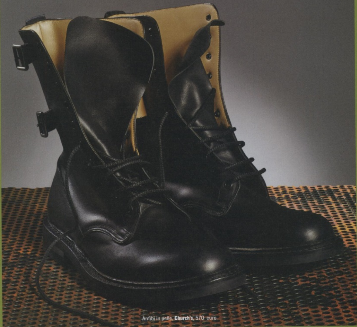
Anfibi in pelle, Church's, 570 euro.

Passo militare e asfalto cittadino. Un tipo di calzatura che regge qualsiasi look , dall'abito ai pantaloni cargo passando per il denim.