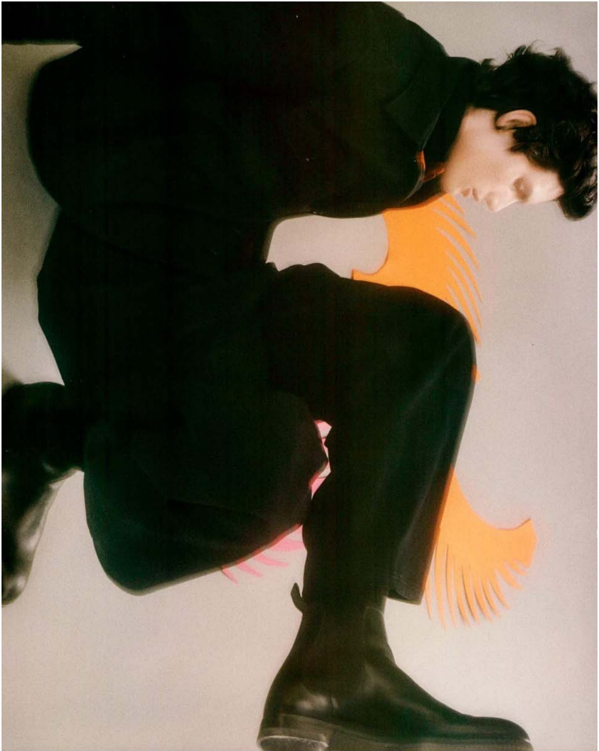
ICON Italia Amberley Black