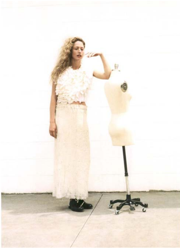
Rapel lleva vestido de través de LOEWE, y zapatos de CHURCH'S. Es el maripal, vestido realizado de un solo hombro del arquero de MAISON MARTIN MARGIELA.