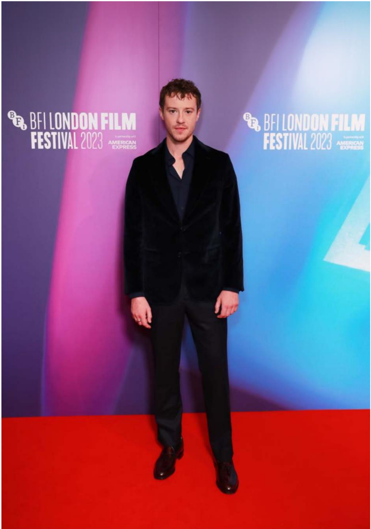
Joseph Quinn at BFI London Film Festival Kingsley Burgundy