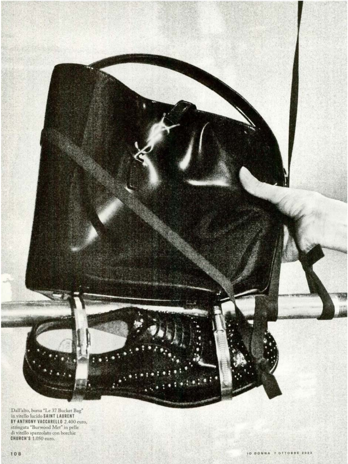
Dall'alto, borsa "Le 37 Bucket Bag" in vitello lucido SAINT LAURENT BY ANTHONY VACCARELLO 2.400 euro, stringata "Burwood Met" in pelle di vitello spazzolato con borchie CHURCH'S 1.050 euro.