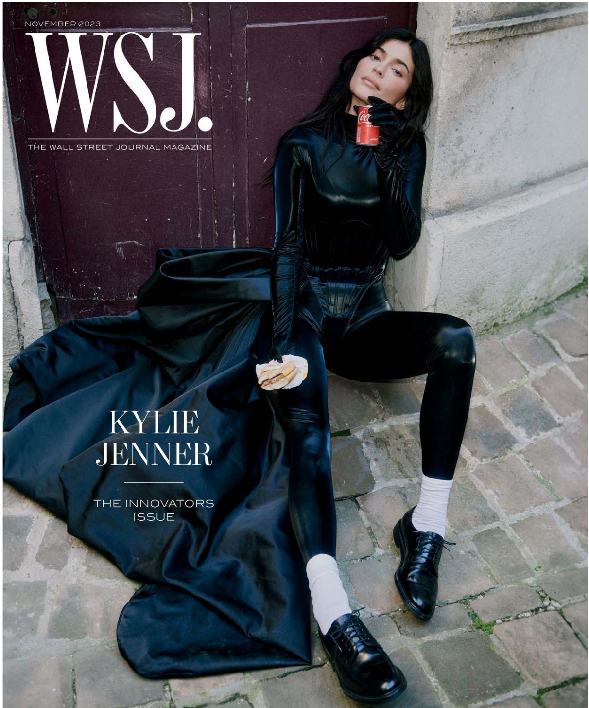
WSJ Cover Kylie Jenner Shannon Black