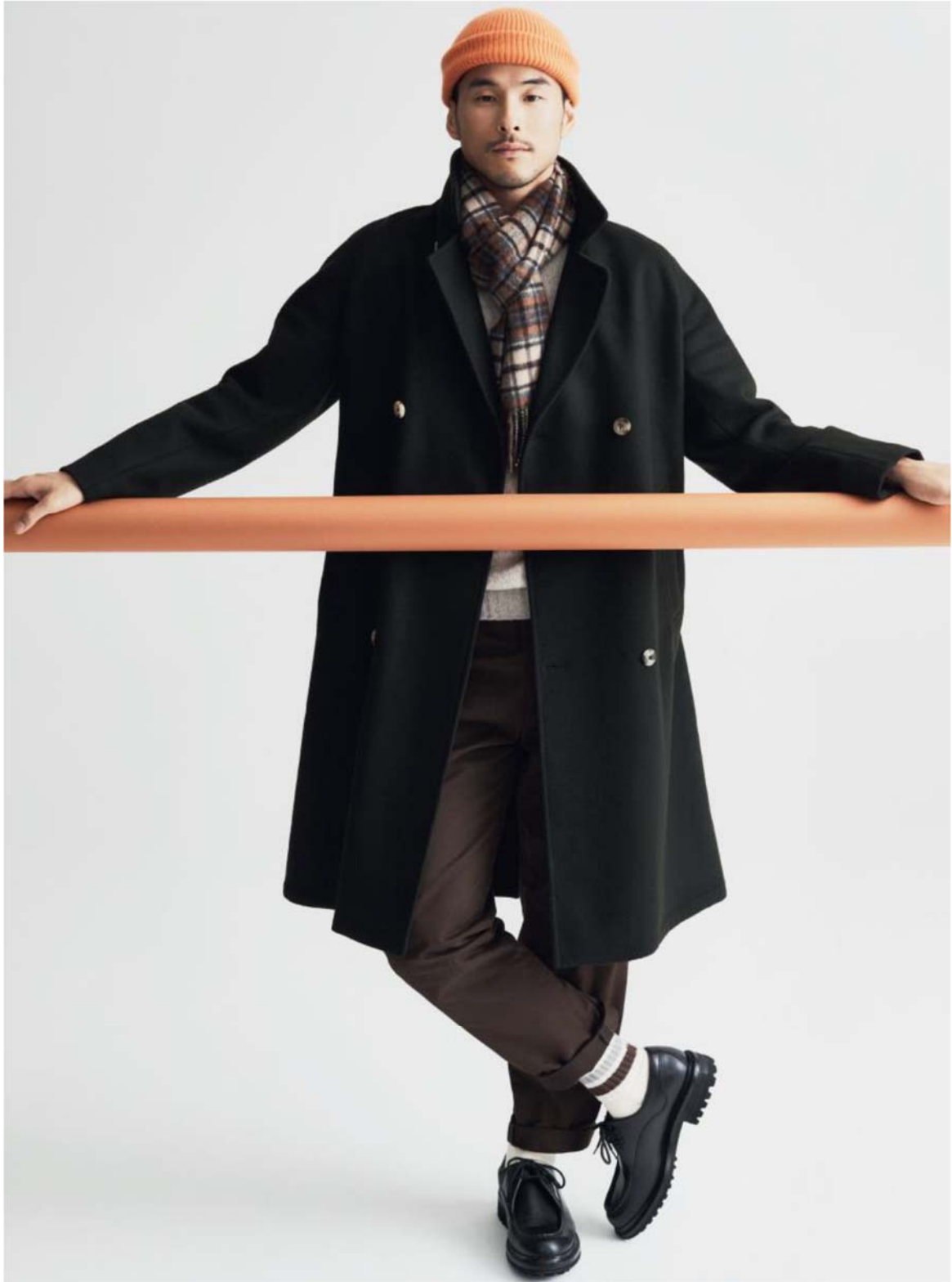
Monocle Lymington Black