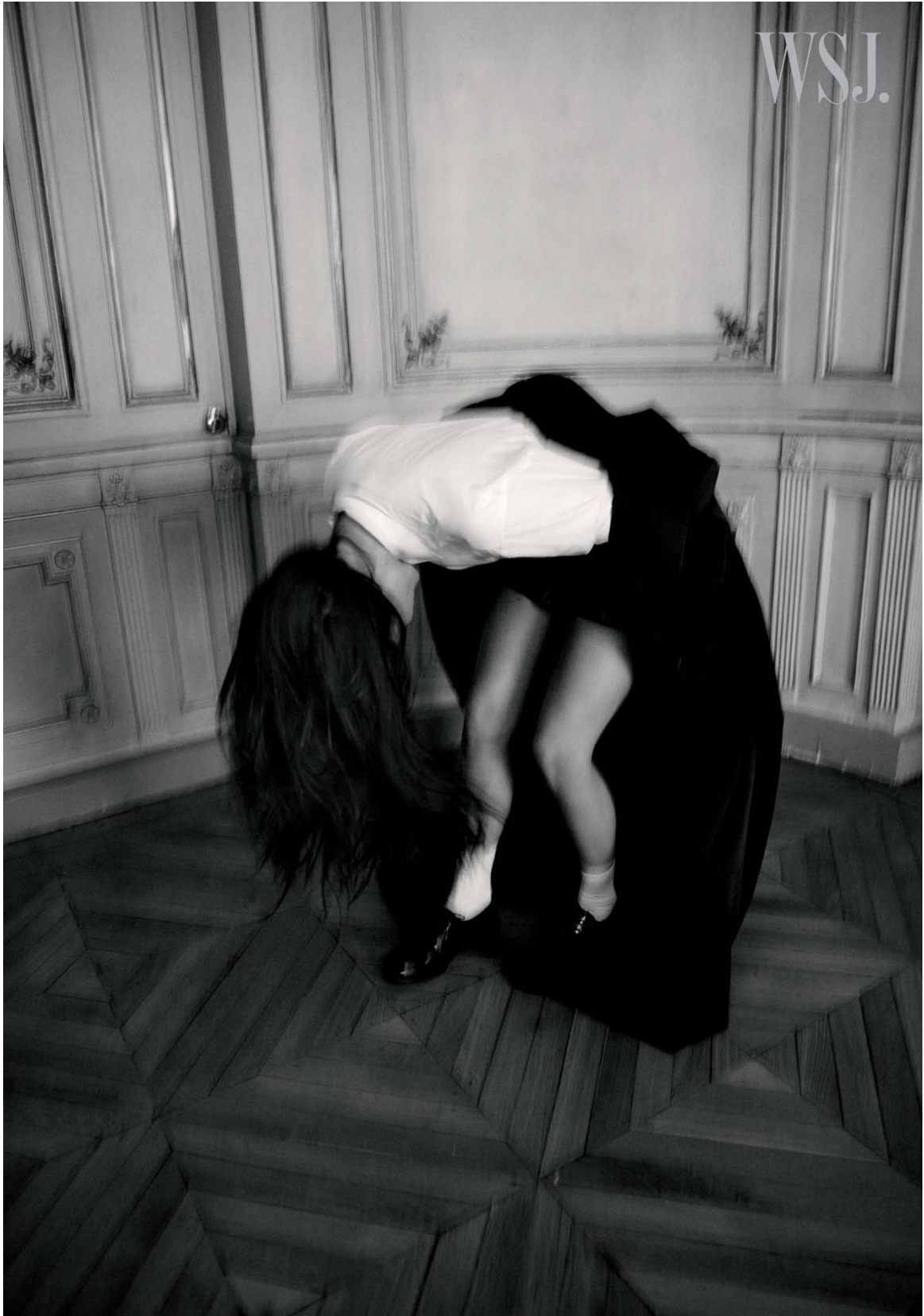
WSJ Kylie Jenner Shannon Black