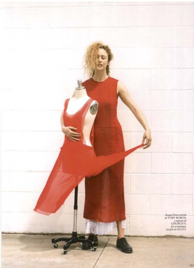
Rapel lleva vestido de TORY BURCH, y zapatos de CHURCH'S. Es el maripal, vestido de GUCCI.